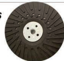
POLY AIR-COOL PLASTIC RESIN FIBRE DISC BACKING PADS