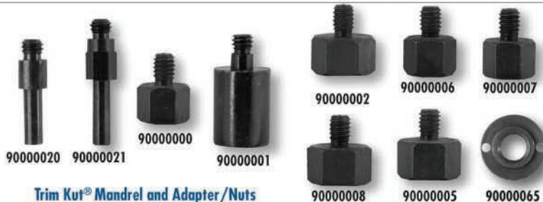
Trim Kut® Mandrel and Adapter/Nuts