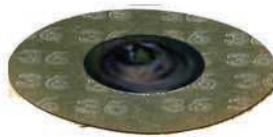
TYPE S SCREW-ON STYLE