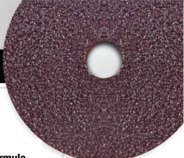
RESIN FIBRE DISC