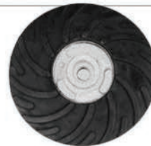
SPIRALCOOL RUBBER RESIN FIBRE DISC BACKING PADS