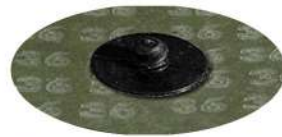
TYPE R ROLL-ON STYLE

Best product to compete against Roloc™ two ply cloth products.