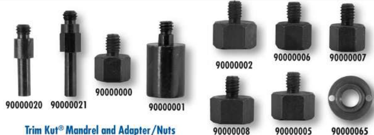
Trim Kut® Mandrel and Adapter/Nuts