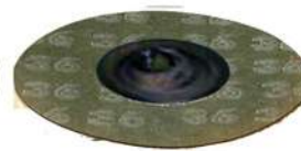
TYPE S SCREW-ON STYLE

Rapid Change Holders Type S Metal Screw-on Locking Style