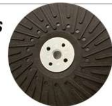
POLY AIR-COOL PLASTIC RESIN FIBRE DISC BACKING PADS