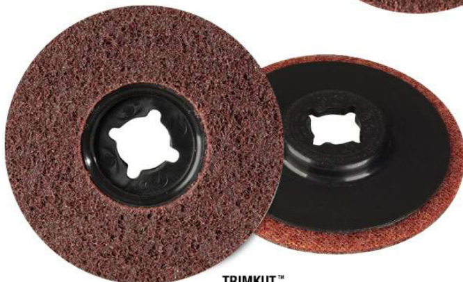
TRIMKUT™ 4 1/2" x 7/8" DEPRESSED CENTER