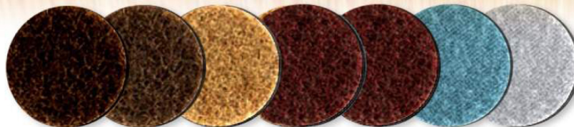
Extra Course HD Brown