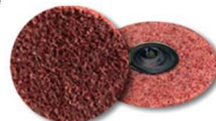
TYPE S 1-1/2" - 4" DIAMETER PLASTIC SCREW-ON LOCKING STYLE