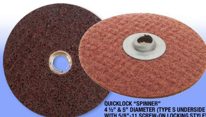
QUICKLOCK "SPINNER" 4 1/2" & 5" DIAMETER (TYPE S UNDERSIDE MOUNT WITH 5/8"-11 SCREW-ON LOCKING STYLE)