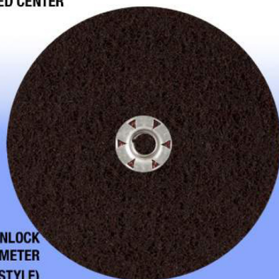
SPINLOCK 4 1/2" & 5" DIAMETER (WITH 5/8"-11 SCREW-ON LOCKING STYLE)